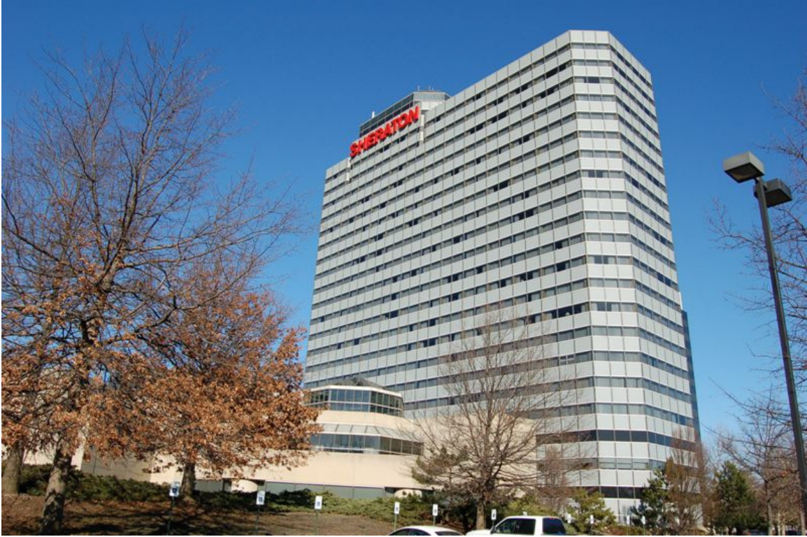
The Sheraton south of Route 3 and the Sports Complex in Secaucus