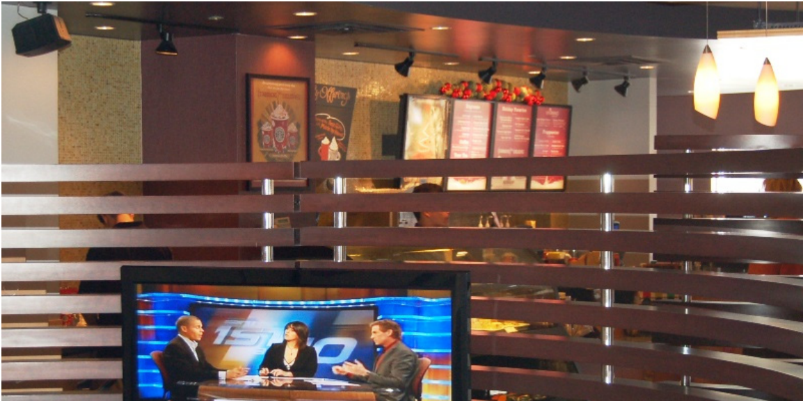
Probably the fanciest, most “wired” Starbucks you’ve seen! A “Web-surfer’s” dream.