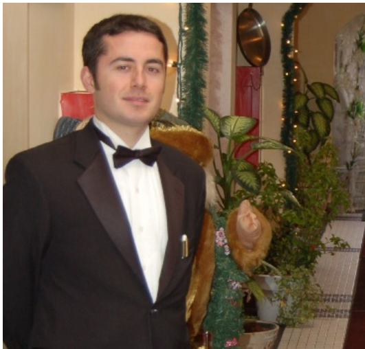
One of the welcoming staff at Dolce Novita